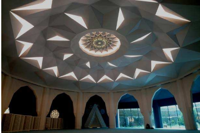
Figure 3: The lower floor praying space. Next to it, is the inner garden which provides the mihrap natural light (Alev Erarslan)

Islamic architecture. Once again, the main space features a covering system comprised of Turkish triangles above the ambulatory corridor which encircles the main space (Figure 4). Celi süllüs style Koranic verses inscribed in medallion are found on each surface of the dodecagonal walls of the ambulatory corridor, painted black and illuminated with a barrisol ceiling (Figure 4, 5).