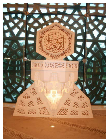
Figure 11: The pulpit ( minber ) of the upper floor prayer venue and the kürsü (Alev Erarslan).