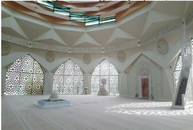
Figure 8: The prayer venue on the upper floor. Mihrap and the geometric decorated shading insides linking the pillars (Alev Erarslan)

Accessed from the Mahir Iz Avenue façade, the upper floor of the building features a triple section riwak in front, which is once again comprised of Turkish triangles, sitting atop four columns (Figure 1). Having assumed the task of entrance, there are two entrances beneath this riwak , situated to the right and left of the structure, which are crafted from the modern kündekari technique, with trunks designed to look like Seljuq victory gates. The main prayer space on the upper floor features a dodecagonal layout set up with 12 concrete pillars with Turkish triangular trunks. These pillars are linked to each other with pointed arches. The glass of the arches is coated with sunscreens decorated with geometric giriş artwork comprised of polygonal star compositions. Consequentially, pointed arches, the insides of which feature geometric decorations, make up the dodecagon of this floor's façade (Figure 8). The design of this façade ensures a distinctive illumination of the interior spaces with light and shadows. The insides of the arch corner pieces feature medallions that were inscribed with the 'Names of Allah' ( Esmâ-ül Hüsnâ ) in 'celi sülüs' style by mosque calligrapher Hüseyin Kutlu (Figure 8, 10). This dodecagonal layout prayer venue is covered by a dome measuring 32-m. wide and 35-m. high which is supported by 12 pillars (Evren, 2009).