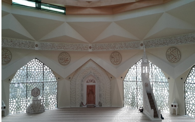
Figure 10: The mihrap , pulpit ( minber ) and sermon dais ( vaaz kursu ) of the upper floor prayer venue (Alev Erarslan)

Once again, the pulpit of the mosque's upper floor praying area was made from fiber-reinforced concrete, whereas it features a large star composition in the center of the side mirror with a colorful rumi-palmette band around it (Figure 11). The pulpit has a bannister and geometric giriş art comprised once more from stars is seen in the pulpit pavilion. The surface of the cone of the pulpit pavillion is decorated with rumi-palmette motifs. The muezzin gallery situated to the east of the pulpit was made from fiber-additive concrete materials and features a hexagon backboard, and eight-point star balustrade and is in the manner of the gallery's sub-muqarnas console. Again, the gallery pedestals are comprised of multi-branched stars.