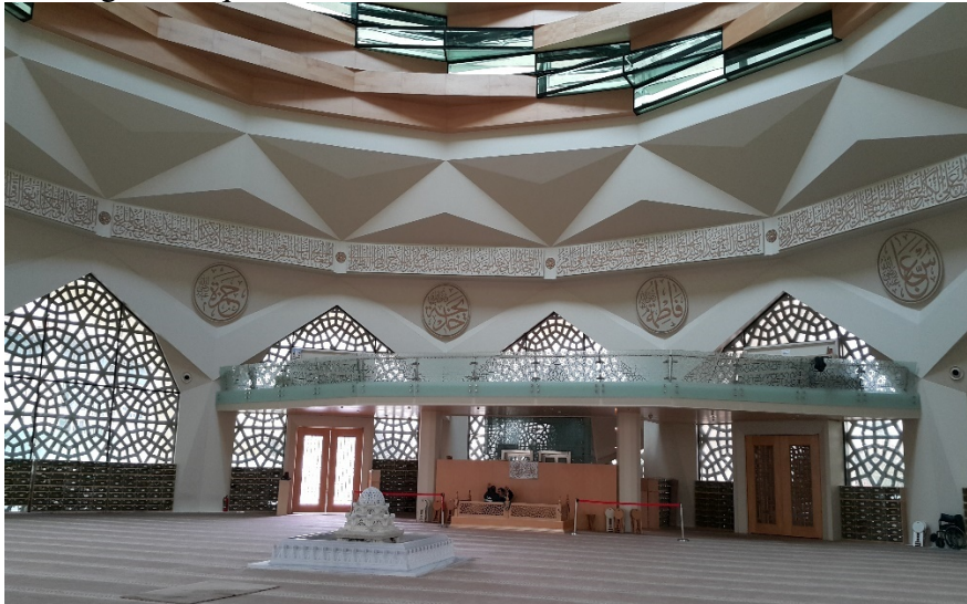
Figure 12: The women’s gallery towards the top floor entrance and the fountain beneath the dome (Alev Erarslan)

The structure has two doors that open into the main praying venue and were produced with glass surfaces, using the modern straight ‘ kundekari ’ technique. building’s elevator was positioned between the pair of entrance doors on both floors and was produced on glass using a geometric decorative sandblasting technique.