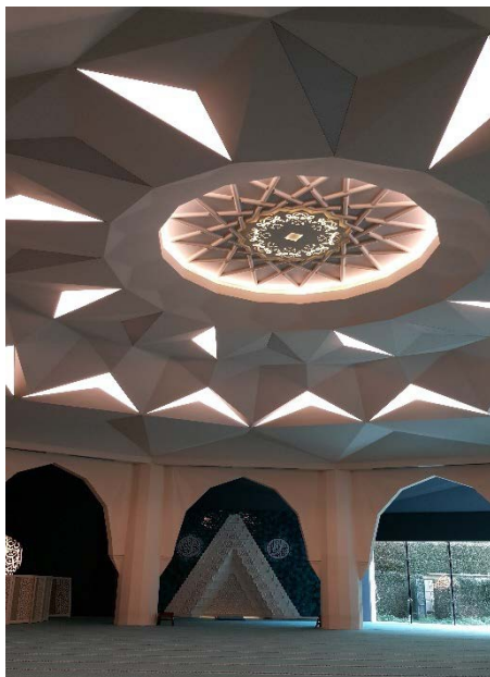
Figure 6: The mihrap which is positioned behind the ambulatory corridor on the lower floor (Alev Erarslan)