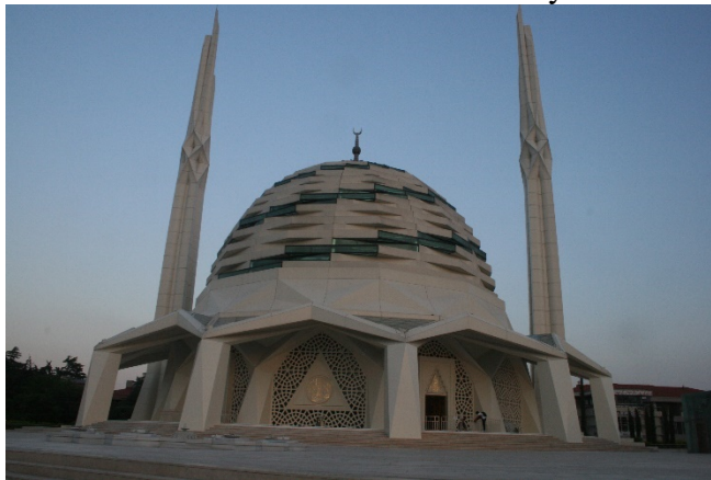
Figure 1: Marmara Ilahiyat Mosque (Alev Erarslan)

Theology and designed by the founder of the Hassa Architecture Bureau, Master Architect Muharrem Hilmi Şenalp, who was also responsible for designing important buildings such as the Tokyo Mosque and Turkish Cultural Center, the Berlin Martyrs' Mosque and Cultural Center, the American Religious Center as well as the Istanbul Museum of the History of Science and Technology in Islam. Constructed in 2015, the structure is situated on land covering around 30,000 m 2 , including the front square and the cultural center beneath (Figure 1). As part of the Marmara University Theology Faculty complex, the building has 8,500 m 2 of indoor space. In addition to serving as a house of prayer, it is also a culture center which provides opportunities for social and cultural activities such as an art gallery, classrooms, faculty member rooms, a library, an auditorium, exhibit halls, a bookshop café, cinevision rooms as well as a carpark (Uzun, 2010). The complex also offers charity sales, and special social, educational and cultural activities geared towards women and children. Established on triangular-shaped premises, the complex features auditoriums on three sides. The ablutions station on the west side has room enough to handle 134 ablutions simultaneously.