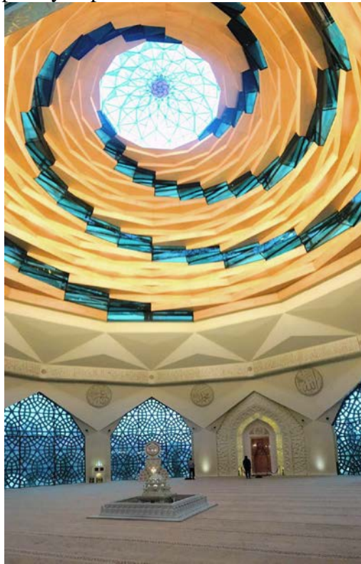
Figure 9: The swallow dome with ‘Wheel of Fortune’ ( çarkıfelek ) glass luminuous intervals covering the upper floor praying space and mihrap and fountain.

also ensure the structure receives natural light. The octagonal luminous glass skylight in the center of the dome is unique to Turkish architecture, its surface is also composed of Turkish triangles. The six intertwining vav inscriptions are striking in the heart of the dome (Figure 9). The transition element to the dome is a Turkish triangle belt found on the dome hoop. Each of the dodecagonal surfaces of the dome hoop are inscribed with examples of ‘ celi sülüs ’ style calligraphy. The light-shadow façade and the glass used in the covering constitute the strongest source of natural light on this floor. The steel dome pinnacle is topped by a special star and crescent which lights up at night.