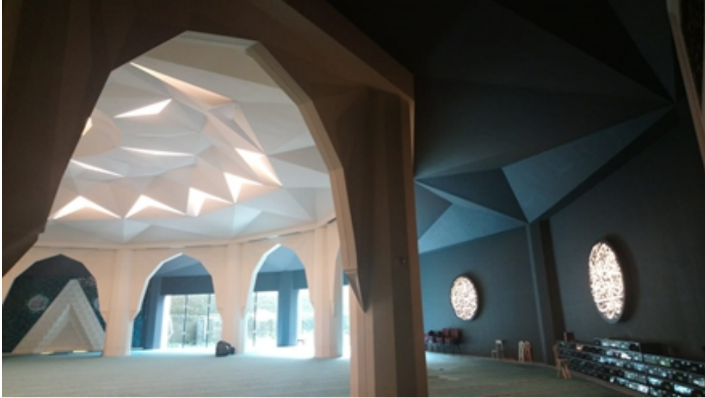
Figure 5: The ambulatory corridor encircling the main domed venue on the lower floor and the medallions in the walls of the ambulatory corridor (Alev Erarslan).

The mihrap of this floor was imbedded into the center of the qibla wall, behind the structure's ambulatory corridor. The mihrap was positioned between the structure's central domed dodecagonal main prayer space and one of the segmented arches that link the polygonal pillars supporting the dome (Figure 6). Garnering attention for its unique design, the mihrap edges feature a segmented triangular shape. Fashioned from fiber-reinforced concrete, there are inside-out Turkish triangles, hexagonal stars and borders comprised of hipped, pointed arches around its surface. Embellishment comprised of hexagonal stars inside the niche arch is found in the center of the mihrap, whereas the surface around the niche is covered with turquoise tiles. The 115 th verse of the Bakara Sura, which reads " fe eynema tuvellu fe semme vecullah ", which means " Allah is everywhere you look " inscribed in 'celi sülius' within the medallions on either side of the mihrap (Figure 6, 7). The mihrap has been illuminated by ensuring natural lighting with a garden situated in line with the qibla wall. For this reason, the wall on this side is comprised of a glass surface in order to illuminate the mihrap with natural light (Figure 5).