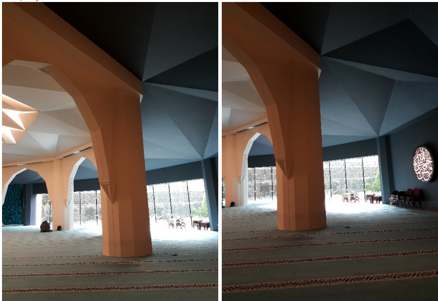
Figure 4: The ambulatory corridor encircling the main domed venue on the lower floor and one of the medallion in the walls of the ambulatory corridor with its Turkish triangular cover (Alev Erarslan)

Islamic architecture. Once again, the main space features a covering system comprised of Turkish triangles above the ambulatory corridor which encircles the main space (Figure 4). Celi süllüs style Koranic verses inscribed in medallion are found on each surface of the dodecagonal walls of the ambulatory corridor, painted black and illuminated with a barrisol ceiling (Figure 4, 5).