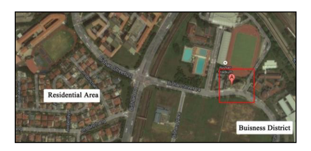
Fig. 6. Location plan of mosque

Regulation stated which for every 20,000 Muslim populations a mosque is needed to fulfill the need of the user. The mosque is located in the middle of Bishan area so visitors can access this mosque from the east, west, south and north side. The mosque is located on a flat land. The setting helps the resident nearby to easily access and use the mosque daily.